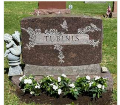
Sample Spring Flower Planting

Can't make it to the cemetery to plant flowers this spring? Or would you prefer if someone else planted them for you? We have a new program for you. We will plant, fertilize and water flowers for you this spring. The number of flowers will depend on the size of your headstone. If you are interested, please either call the cemetery, or simply fill out the form on the cemetery website.